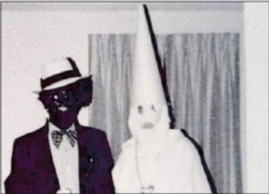
Of you were anger over a 25-year old yearbook photo of Virginia’s Democratic Governor, Ralph Northam’s page in his 1984yearbook of Eastern Virginia Medical School and say nothing of his endorsement on murdering babies as they are born you have got to be a special kind of stupid.