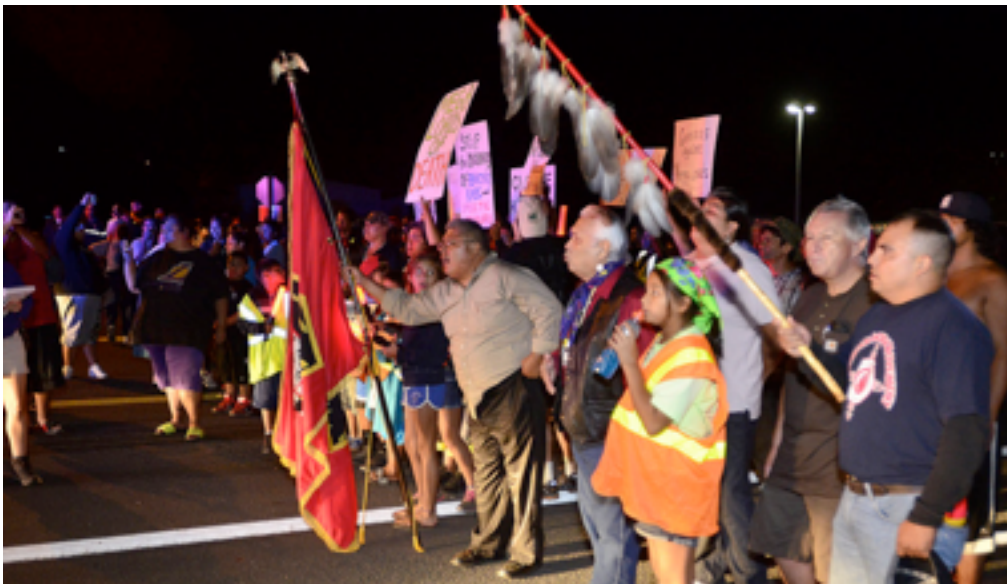
Tribe Blockades 'Megaload' of Tar Sands Equipment

The Keystone XL pipeline alternative you've never heard of is probably going to be built Electric roads could make plugging in your EV a thing of the past