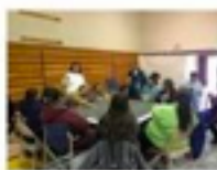
5's Card Tournament