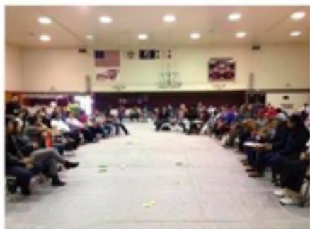
2013 VALENTINES WINNERS