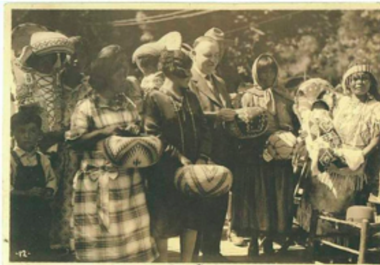
Awarding prizes to Mono County Basket Makers Yosemite Valley, California, 1929