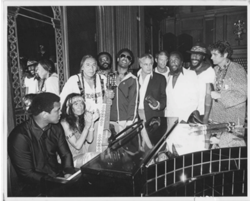
A photo from the concert at the end of The American Indian Movement's "The Longest Walk", Washington, DC, July 1978

(From left: Muhammad Ali, Buffy Sainte-Marie, Floyd Red Crow Westerman, Stevie Wonder,