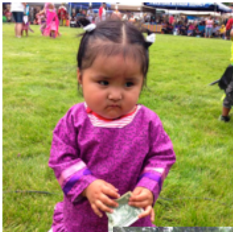
Faces of the Stewart PowWow