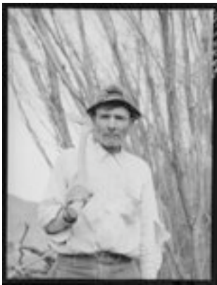
Indian woodcutter. McDermitt Reservation, Nevada March 1940