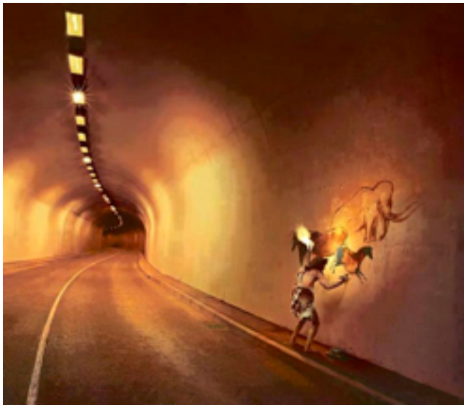
Post Apocalypse... Art People Gallery

Obama signs law for settlement with Pyramid Lake Paiute Tribe All German universities will be free of charge Archaeology Magazine Promise Zone Webinars Posted Community's first comprehensive go-to resource guide for youth ages 12 to 24 JOEL OLSTEEN SHOCKS HIS CONGREGATION From SBA Pollution and other shorts from The Stream Are Wolves Heroes? Gayle Hansen-Johnson singing Red White and Blue Genocide by Other Means: U.S. Army Slaughtered Buffalo to Fight Natives The Danger of Censoring Our History Native American Warriors: Federal government orders 20 U.S. states to change their names National Womens History Museum features Dr. Susan La Flesche Picotte YOUNG SPIRIT - THE WORD SONG Student Video Contest Pacific Northwest Tribes Fight to Save Threatened Salmon