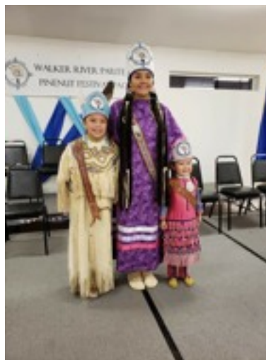
With Walker River Royalty