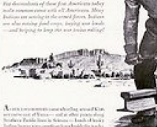
Fig decembers of their first American today.

Define however non-provinge transferable to is who