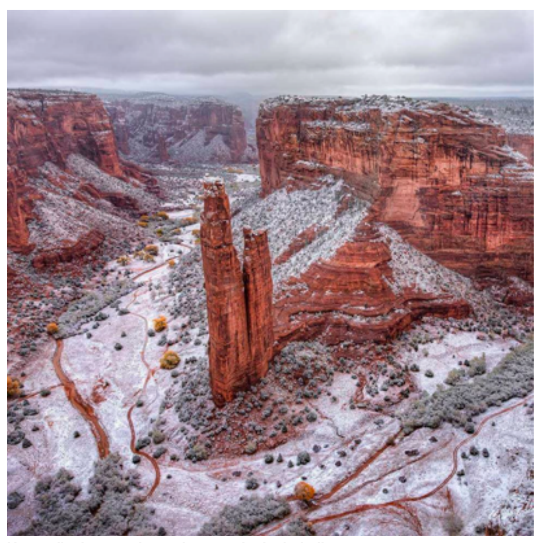
No credits but too dramatic to not be included!

https://www.dailykos.com/story/2018/1/19/1732126/-Erosion-May-Transform-the-Arctic-Food-Chain