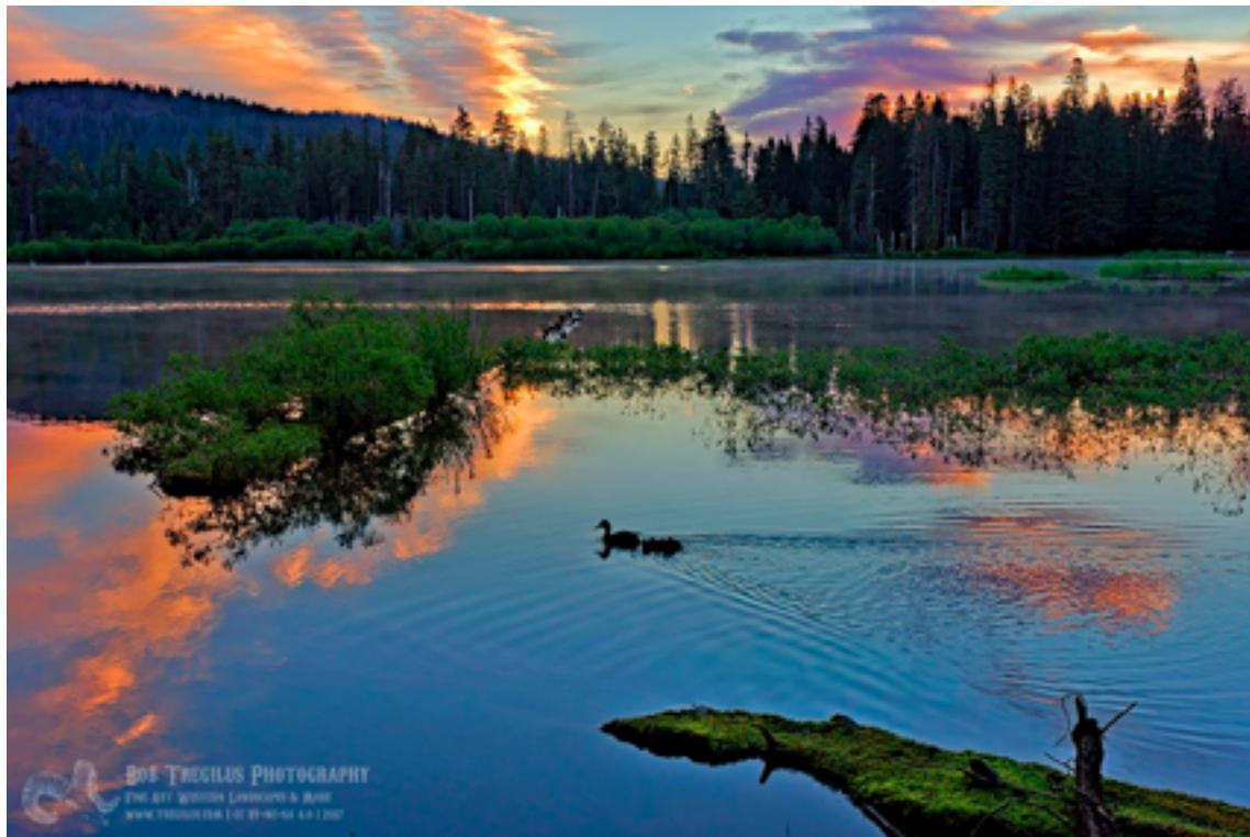
Sunrise at Manzanita Lake, Lassen Volcanic National Park , CA, 06/10/2016.