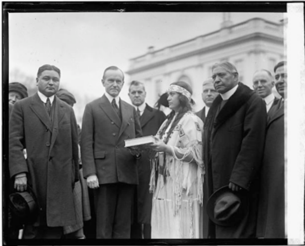
Calvin Coolidge meets Ruth Muskrat on December 12, 1923.