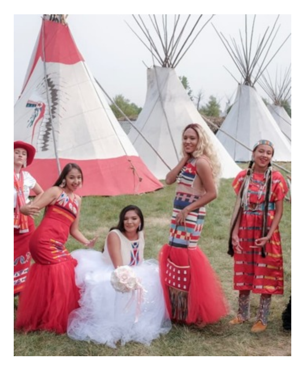
Crow bridal party.

More Calendar Great Nevada Picture Hunt Oregon issues approval to remove J.C. Boyle Dam on the Klamath River Trump's Keystone XL Pipeline in Peril As Native American Tribes Sue State Department Eighth Generation Blankets Nevada Humanities Literary Crawl More Samples from Big Sky Country Digital Network Sample of material from Montana Historical Society's Research Center Miscellaneous entry sample in Big Sky Country Digital Network