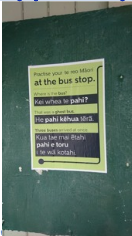
From a bus stop in Wellington, New Zealand!