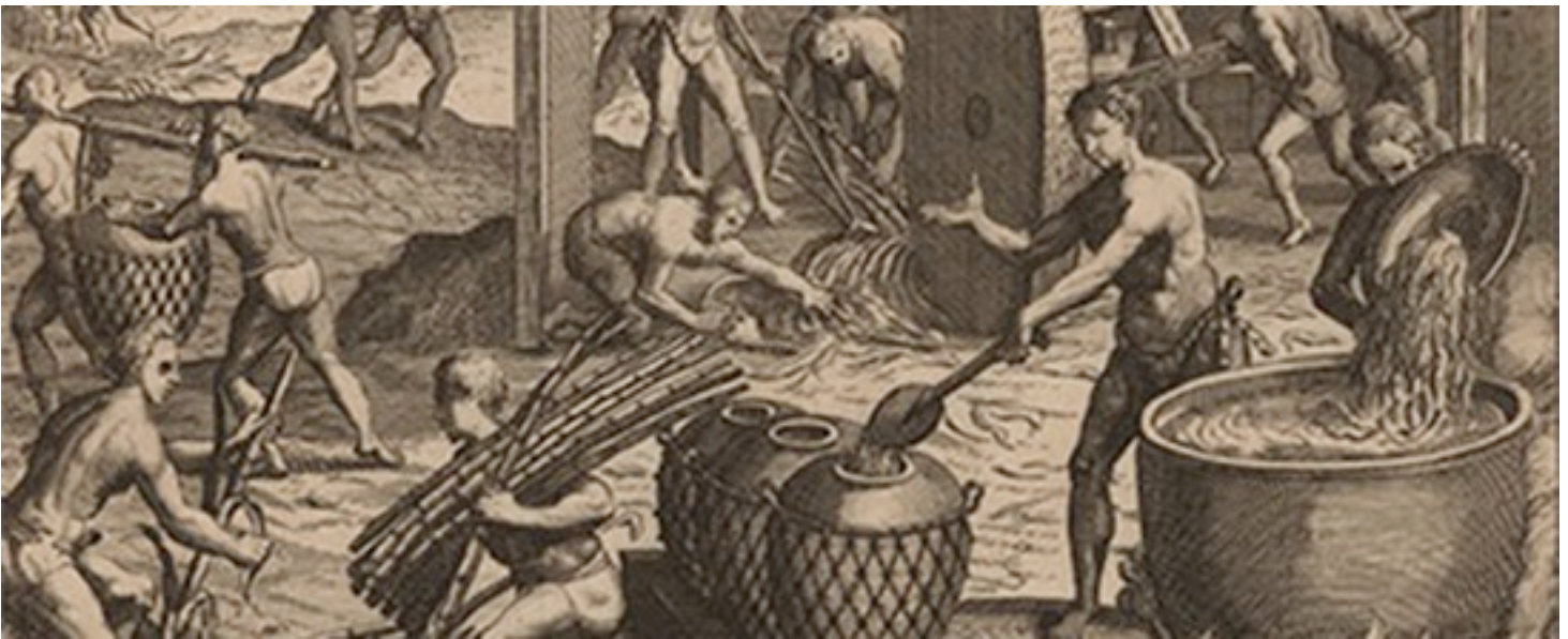
Illustration from Naaukeurige versameling der gedenk-waardigste zee en land-reysen na Oost en West-Indiën... zedert het jaar 1492 tot 1499 (Careful collection of the most memorable sea and land trips to the East and West Indies... dates from 1492 to 1499), published by Pieter van der Aa, 1707.