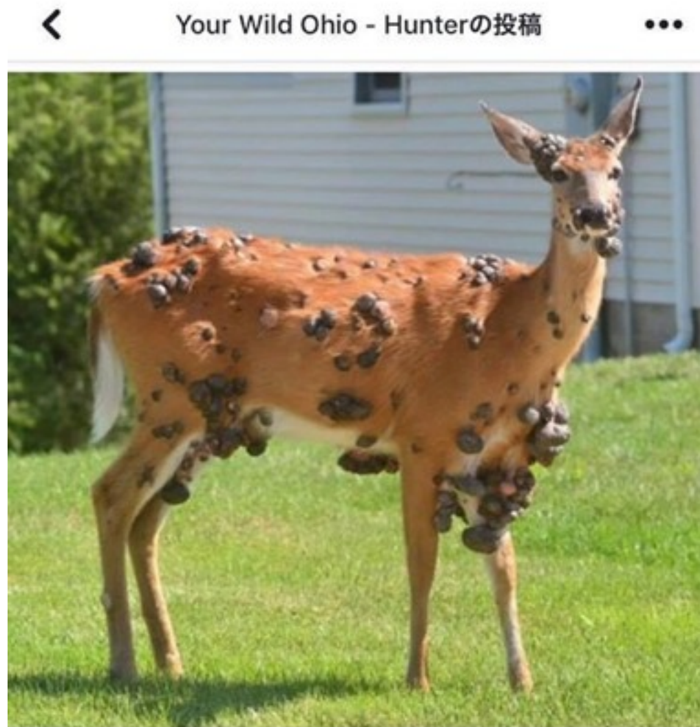
Seiichiro Hosokawa A deer that became riddled with tumors from eating plants sprayed with Monsanto's Roundup. It seems fairly common.