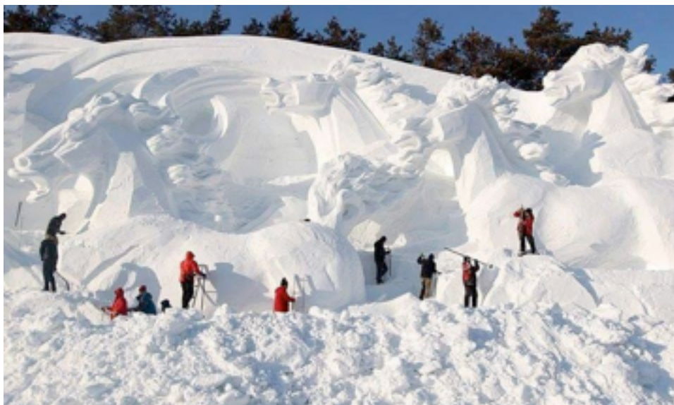
Snow Sculpting (look closely)

Fly over the Sierra Nevada - first Donner Lake area, then along the Truckee River between Truckee and Lake Tahoe, and finally along the South Yuba River at Hampshire Rocks Campground. The snow in this area is key to California's water supply.