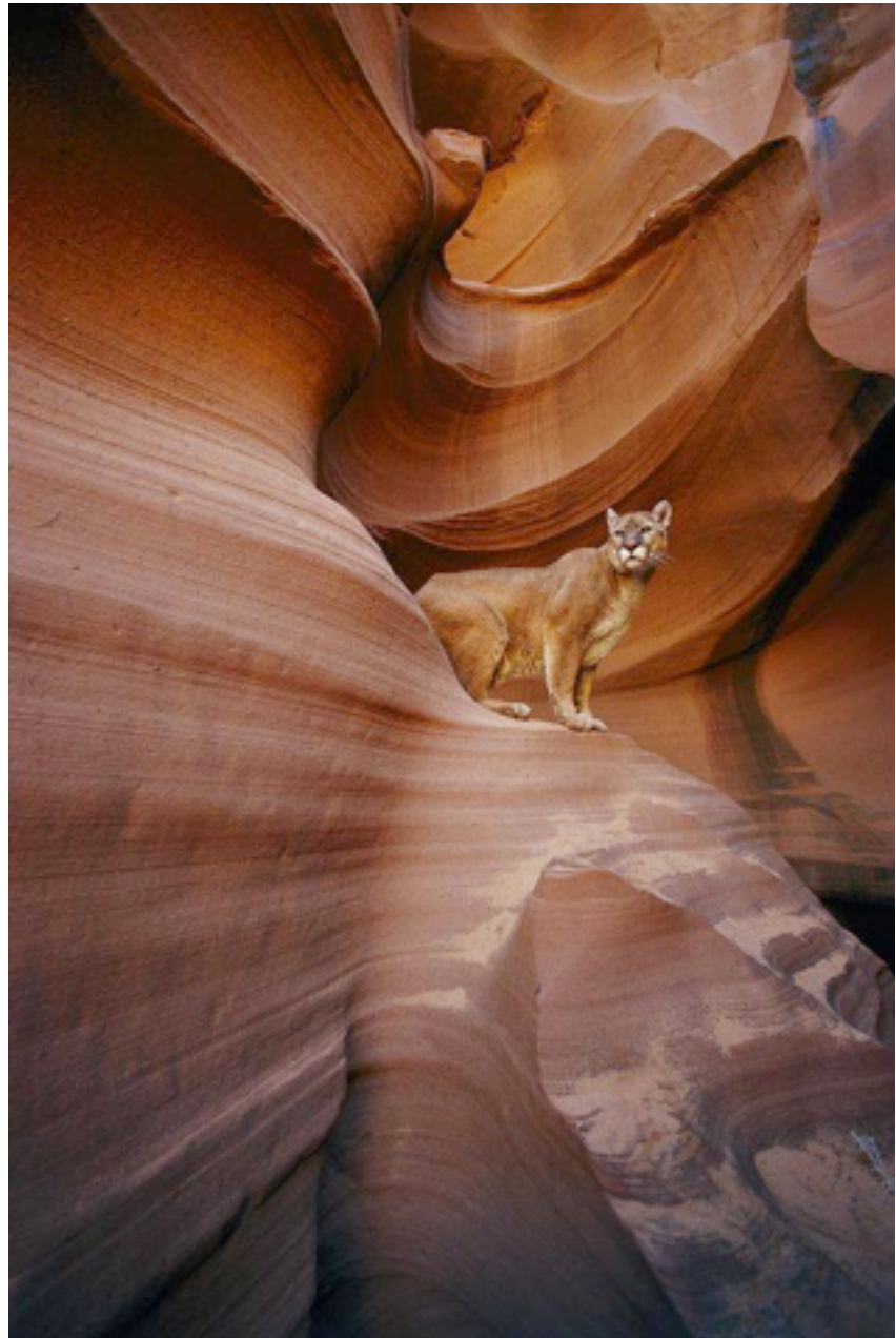
A mountain lion pauses on a ledge inside this swirled rock chasm, Antelope Canyon in northern Arizona by Norbert Rosing — with Marcelo Gonzalez-valdes .

Trump Jr. applauds racist Native American jokes, sarcastically calls father 'savage' Utah-rep-wants-mostly-white-part-of-county-to-secede-from-mostly-Navajo-part-after-lost-election Kooyooe Tukadu Cultural & Language Program Citizen Archivist Road Trip Update! Nevada Tribes Legislative Day Young Grass Dancer Talks Pow Wow with CBC Kids EPA Environmental Justice Small Grants Wild Classroom, WWF's educational resource WaterSMART Grants: Water and Energy Efficiency Grants for Fiscal Year 2019 Classic Paiute Story Nevada goes back to court to block plutonium shipments Nevada Sen. Cortez Masto files bill to protect Ruby Mountains Candidates sought for Tule Springs monument advisory council Richard "Peanuts" Quintero