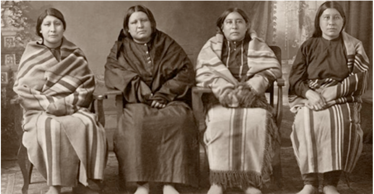
In The 1920s, A Community Conspired To Kill Native Americans For Their Oil Money