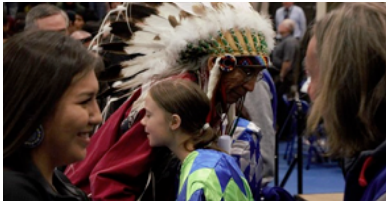
Swedish activist Greta Thunberg brings climate message to Standing Rock Sioux Nation | West Fargo Pioneer westfargopioneer.com