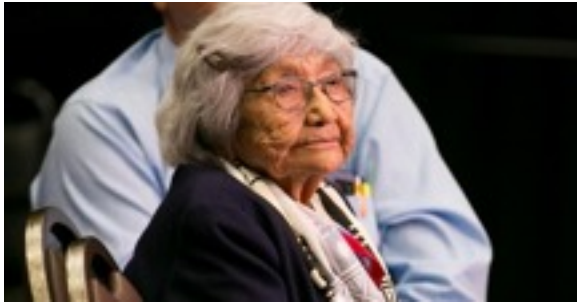
Yakama linguist honored for a lifetime of reviving Native languages yakimaherald.com