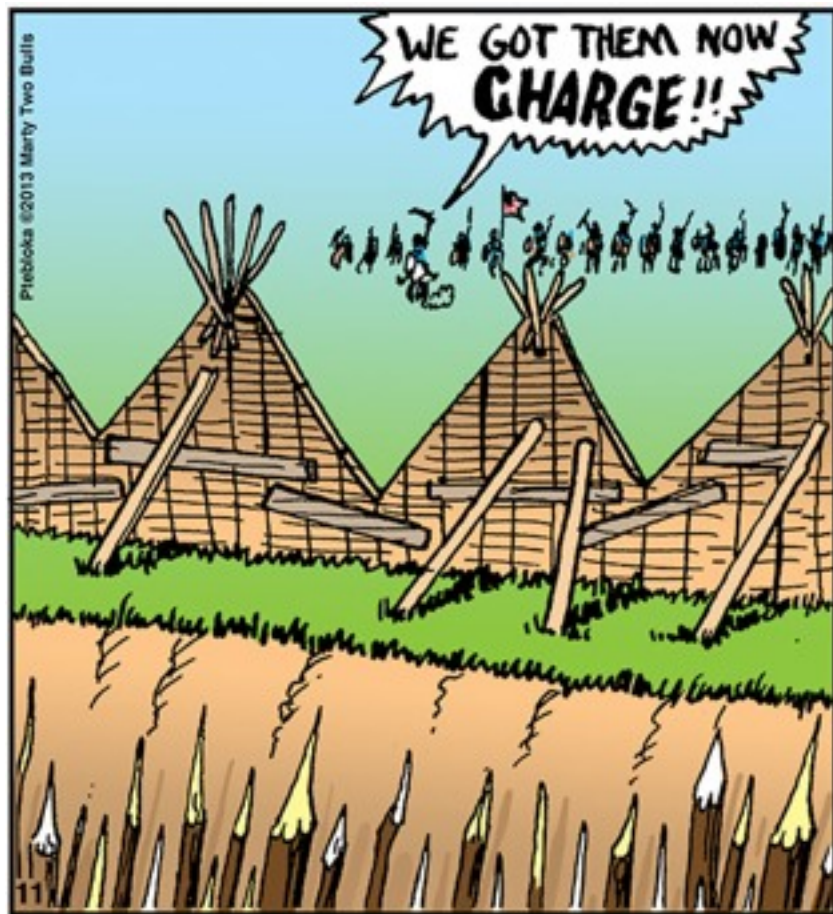
Old indian trick!