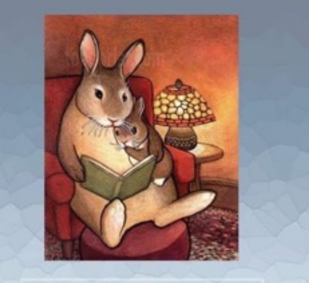
There is no app to replace your lap

So that's a summary of my Thanksgiving lesson plans I did for my preschoolers! Always a constant