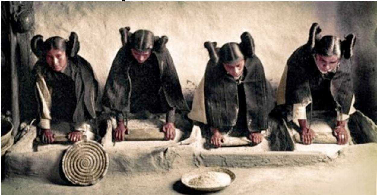
Four young Hopi Indian women grinding grain, c. 1906