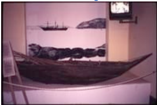
Indian canoe on display in Navy museum Child, Jack (Creator)

View Full Item in Georgetown University Library