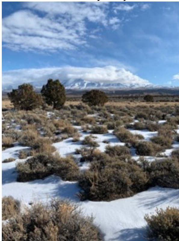
Diamond Peak by Wally Cuchine