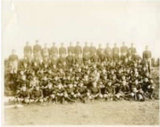
Pennsylvania School for the Deaf, Carlisle Indian Squad (1915)