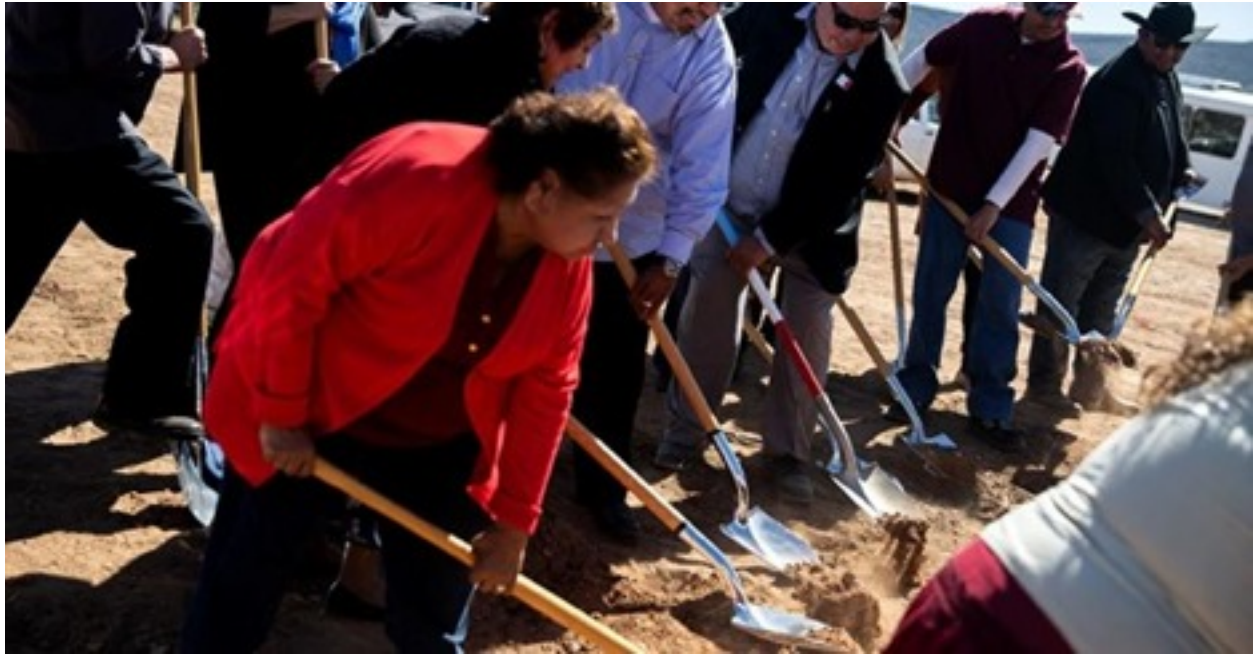
Pascua Yaqui Tribe building care homes for its membersThe facilities will offer residential treatment services and assisted living. They are expected to be<br/>complete by the end of the year.tucson.com

"It is not the brains that matter most, but that which guides them — the character, the heart, generous qualities, progressive ideas."