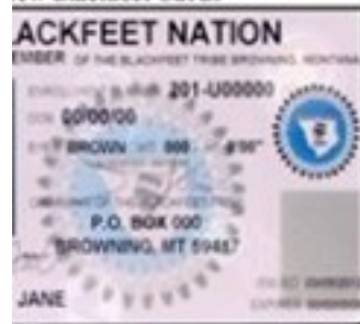
New Blackfeet Cards

The White House announced Tuesday that it plans to veto the PFAS Action Act of 2019, which aims to keep harmful forever chemicals out of groundwater.