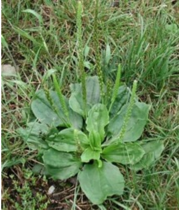
The Soul Sanctuary