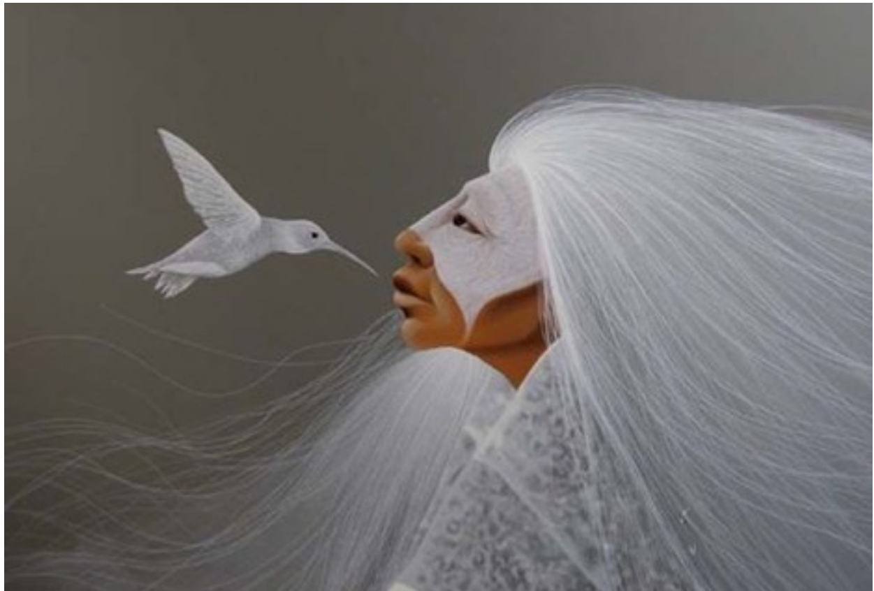
Non-credited post on FB