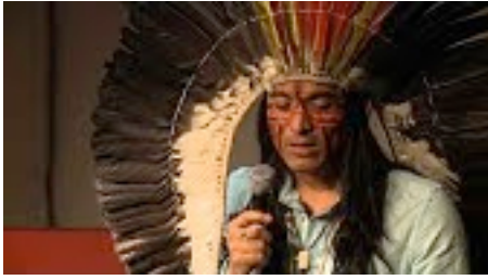
We are all connected with nature: Nixiwaka Yawanawa at TEDxHackney TEDx Talks;1