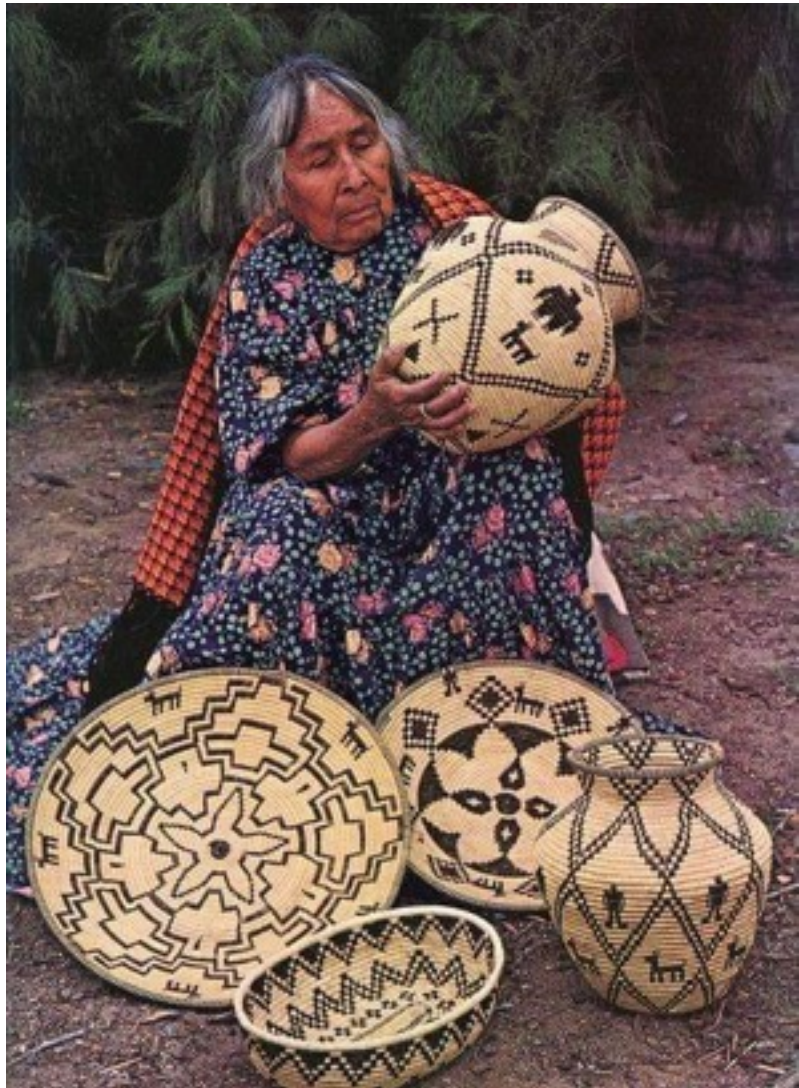
Woman of the APACHES tribe doing her basket work

Who Invented Toilet Paper—and What Came Before