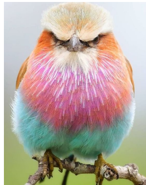
A lilac breasted roller.

Creator: Department of the Interior. Bureau of Reclamation. 5/18/1981-