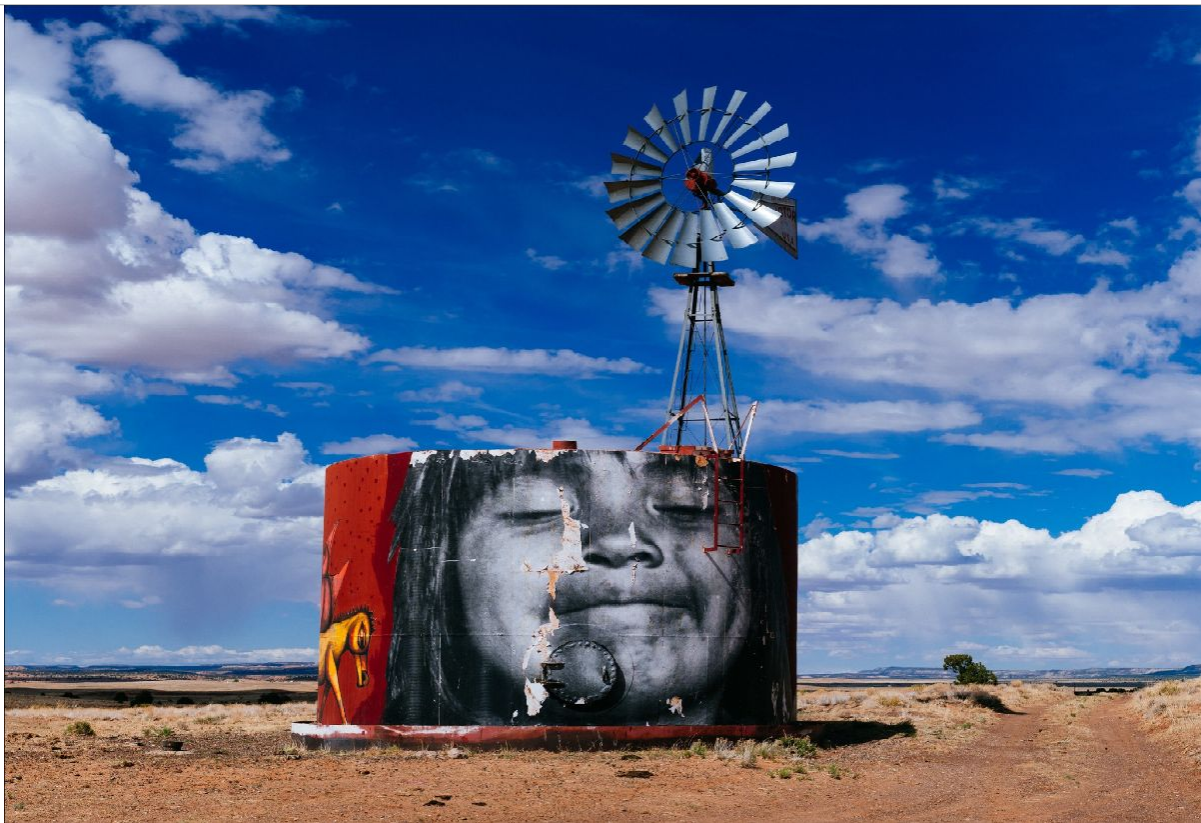
A water tank on the Navajo Nation.

South Lake Tahoe prepared to hand out $1000 tickets