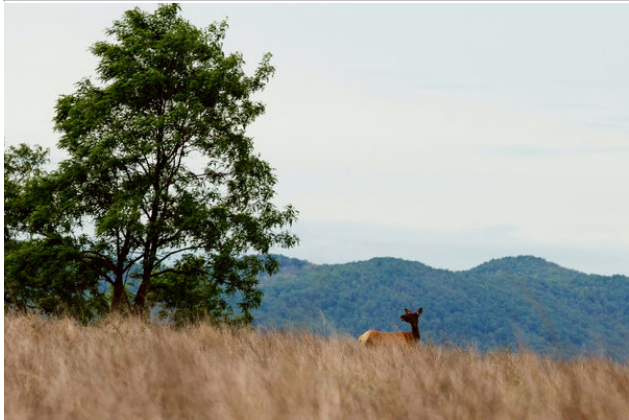
Return of the Kentucky elk

The new projects will address digital inclusion, community memory, and school library practice.