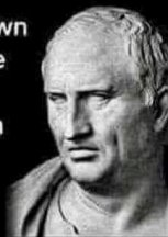
Cicero, Roman Statesman, 42 BC

"A nation can survive its fools, and even the ambitious. But it cannot survive treason from within. For the traitor appears not a traitor — He speaks in the accents familiar to his victims, and he appeals to the baseness that lies deep in the hearts of all men. He rots the soul of a nation—he works secretly and unknown in the night to undermine the pillars of a city—he infects the body politic so that it can no longer resist. A murderer is less to be feared."