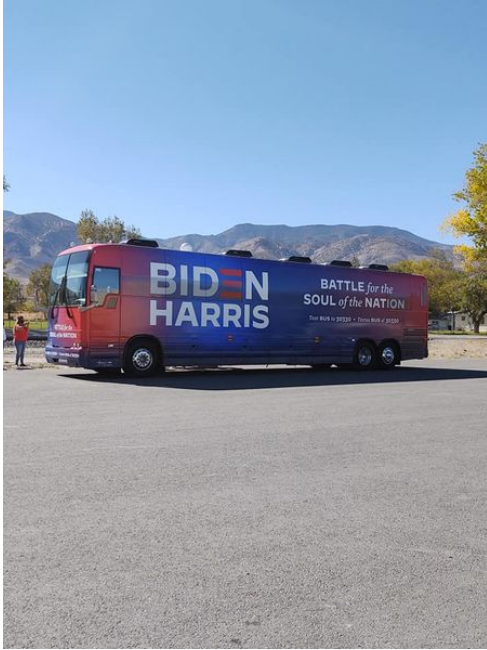
Biden-Harris bus stopped at Walker River on 10.19.20 and will be at Nixon at 6 pm today!