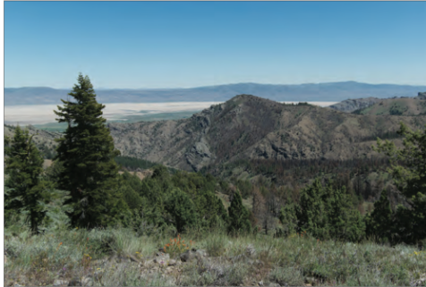
Figure 5.5.1 —Native Americans often view the natural world differently than do government agencies, particularly in terms of economic benefits, cultural connections, and spirituality.