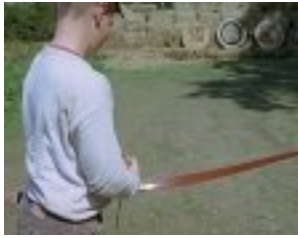
Camp Mohawk (1965) A summer camp for boys with a red Indian theme is run by American airmen based in...