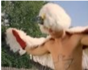
Mohawk Camp (1960)

A tribe of American Indians perform a traditional rain dance.