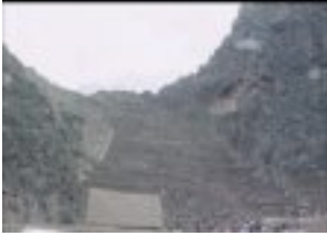
Peru: Congress Of American Indians Is Attended By Delegates From Latin America,... (1980)