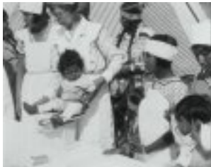
Papooses! (1928) Various shots of Native American Indian babies being weighed by Caucasian nurses.