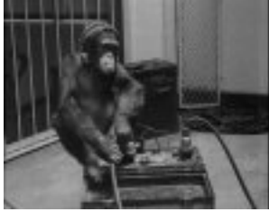
Me And My Pal (1933)

Two chimpanzees play cowboys and American-Indians at St Louis Zoo.