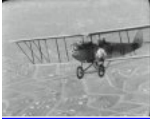
A Real Hair Raising Affair (1926) Stunt involving an American Indian being suspended from a plane by...