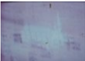
U.S.A.: Sioux Indians Compensated For Land Taken By The American Government More... (1980)

Good shots - traditional methods of totem pole wood carving.