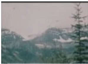
Canada: Canada's "Forgotten People," The North American Indians, Turn To... (1977)