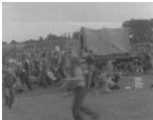
An Inspiring Spectacle Of Youth (1931)

American-Indians meet in Arizona for their annual Pow Wow - includes beauty contest.