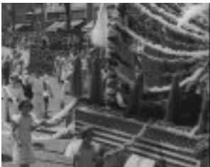
Centennial Parade (1931)

Englishman who grew up with Indians in Canada showing traditional Indian skills.