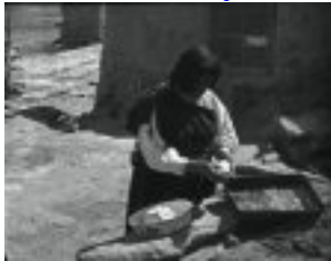
Indians Of The Southwest (1930) Footage of an American Indian settlement - a woman cooks bread in a...