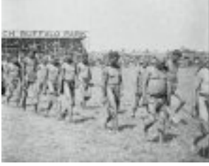
All The Big Chiefs (1922)

Native American tribal chiefs meet for powwow at Fort Bliss, Texas.