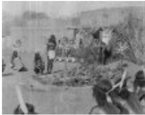
The Dance Of The Snakes (1932)

Two chimpanzees play cowboys and American-Indians at St Louis Zoo.