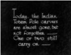
The Super Carver (1933)

Various faces are contrasted including American Indians, an Arabian Sheik and a Chinese man.