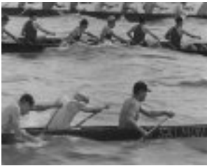
Over The Rollers Dublin Issue (1941)