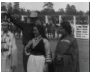
POW Wow! (1940)