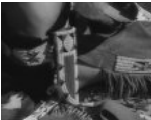
Red Indian (1954)