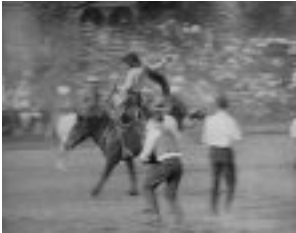
"Real Rough Stuff" (1930)

A parade of Native Americans acts as prelude to rodeo activity in California.