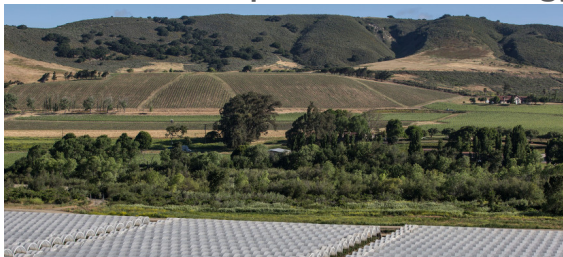
Bill McKibben, The New Yorker

McKibben writes: "To see the Biden Administration starting to move on the climate challenge is invigorating, but it's worth remembering how far behind we are." READ MORE