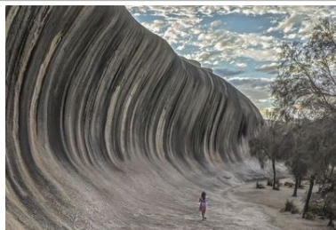
Wave Rock is a natural rock formation in Australia. It's shaped like a wave and is 49 ft (15 meters) tall 🌊