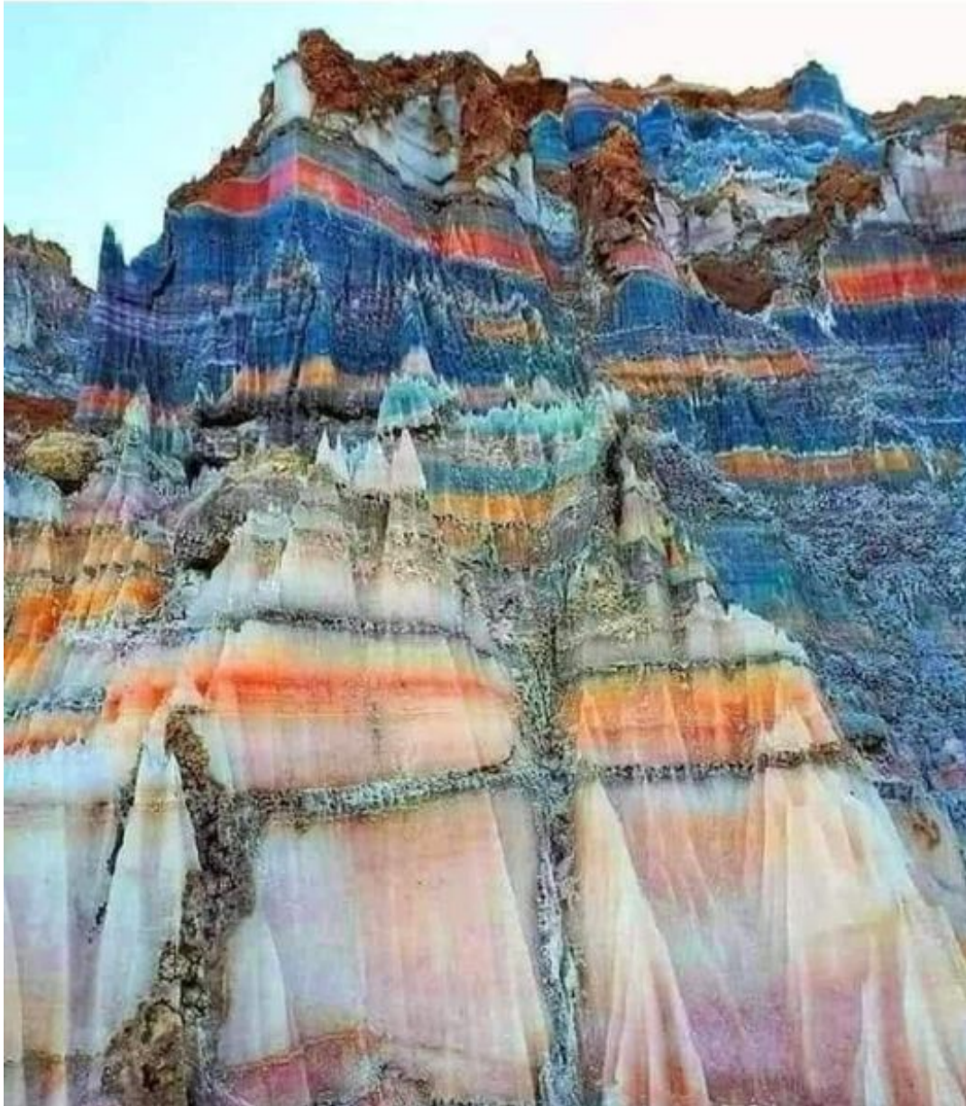
Salt Mountains, Iran

Magnets: The Hidden Objects Powering Your Life