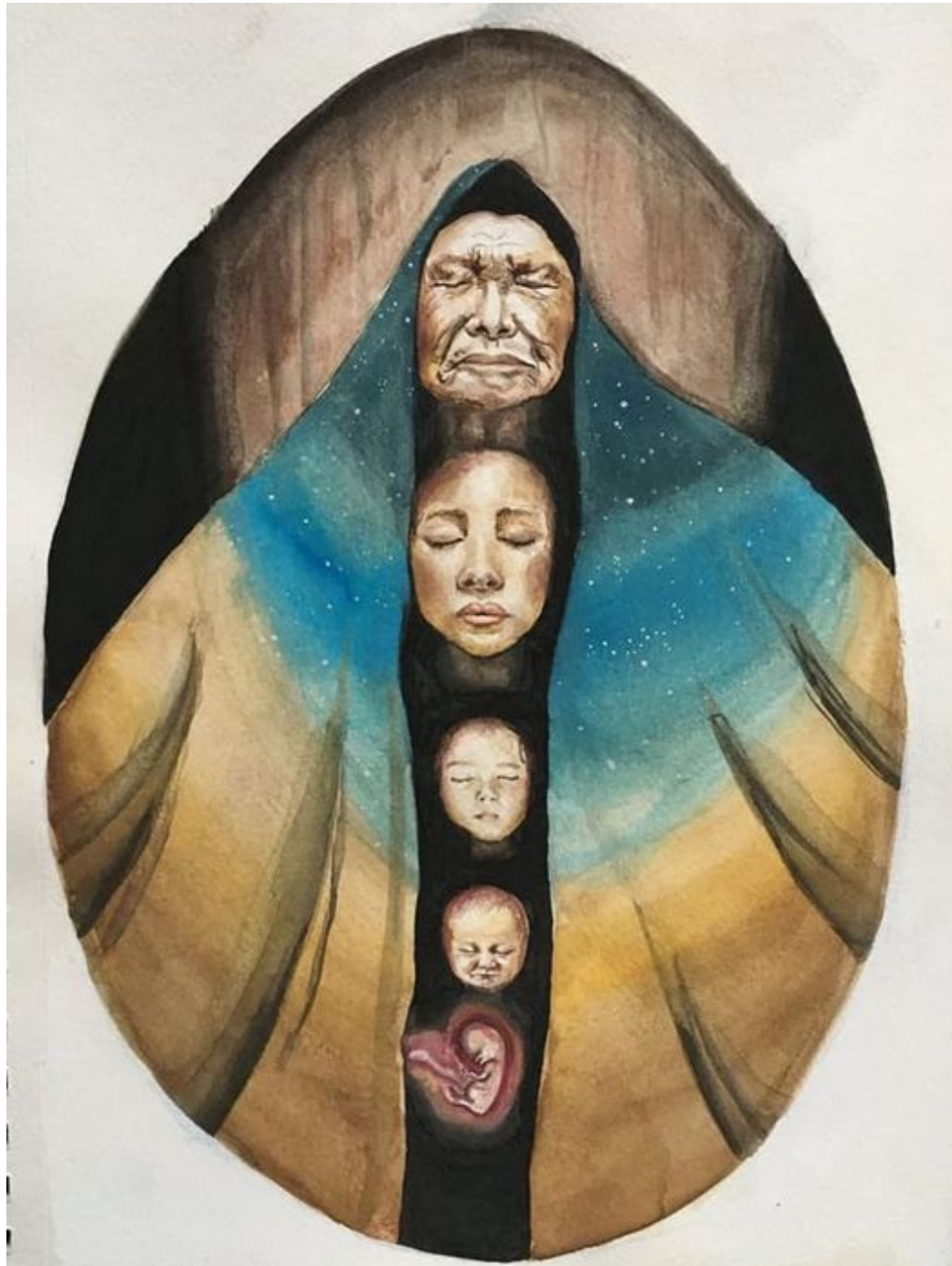
Relentless Indigenous Woman

Your grandmothers' prayers still carry you ❤️