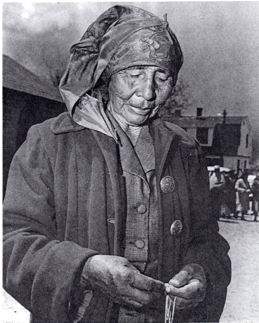
Nina Winnemucca, recipient of Bishop's Cross

Minnesota's OK for Enbridge to temporarily move 5B gallons of water sows tension http://strib.mn/3y6YAZ3