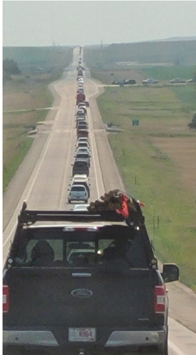
(Contemporary Trail of Tears)

Bringing the 9 Babies back from Carsile, PA back to the Rosebud Sioux Tribe,