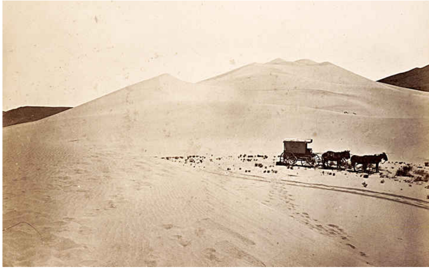
In the Carson Sink

During the Old West, cameras were a very new invention, and were extremely rare.