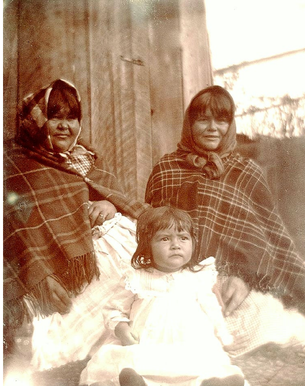
(Unidentified) Paiute Women and Child Wadsworth provided by Dee Numa Let's Get All Those Thousands of "Unidentified" Pictures Identified! sdc

Inspiring Native American designers, activists, and influencers to follow