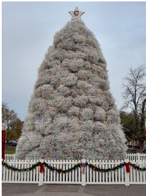
Tumbleweed Xmas Tree Pat Wittman · ·

Thought you would like to see something a little different.. A 20 ft wide x 35 ft tall tumbleweed Christmas tree in downtown Chandler, Arizona (a city near Phoenix, AZ ). The 1,000 tumbleweeds (dead Russian thistle plants) are gathered from surrounding desert, sprayed w/fire retardant, affixed to frame, wrapped with 1200 led lights and bingo a Christmas Tree Arizona style.