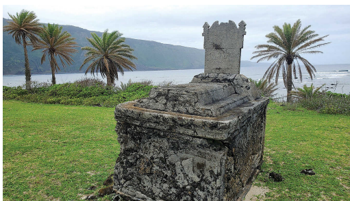
One of 1,200 known grave markers on Molokai's Kalaupapa Peninsula.

HOPE Crew Project Honors Hawaiians Quarantined on Kalaupapa https://savingplaces.org/stories/hope-crew-kalaupapa#.YiUUGy-B3BI