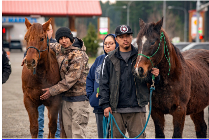
Nisqually Indian Tribe