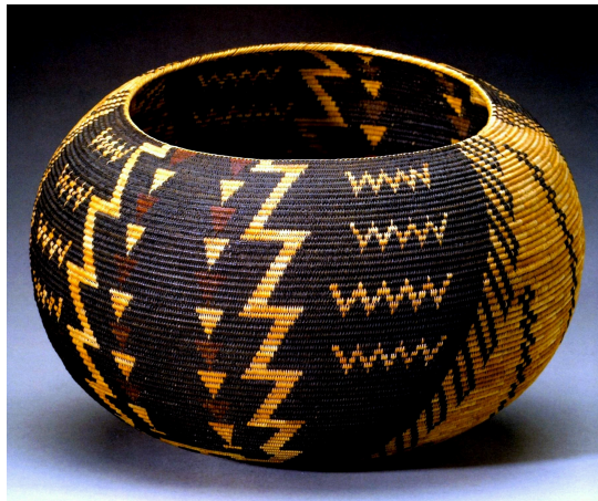
A Yosemite-Mono-Lake-Paiute Polychrome Basket

Tina Charlie , 1926, the deep globular container is finely woven with opposing dark panels of negative zigzags framing twin columns of stacked arrowheads in contrasting colors, flanked by floating serrates and lined with linear appendages, alternating with series of small stacked crosses. height 8in, diameter 12 1/2in