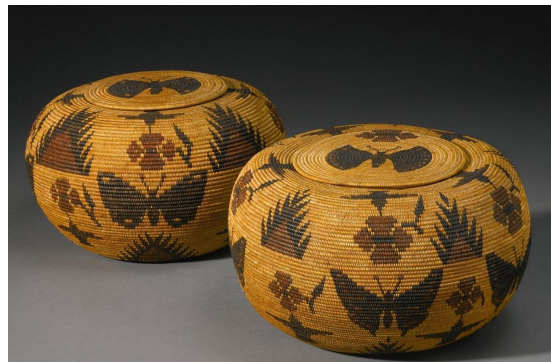
Dee Numa. 2Marcp6hs 19rm,h4 2020 ·

Tina Charlie , 1926, the deep globular container is finely woven with opposing dark panels of negative zigzags framing twin columns of stacked arrowheads in contrasting colors, flanked by floating serrates and lined with linear appendages, alternating with series of small stacked crosses. height 8in, diameter 12 1/2in