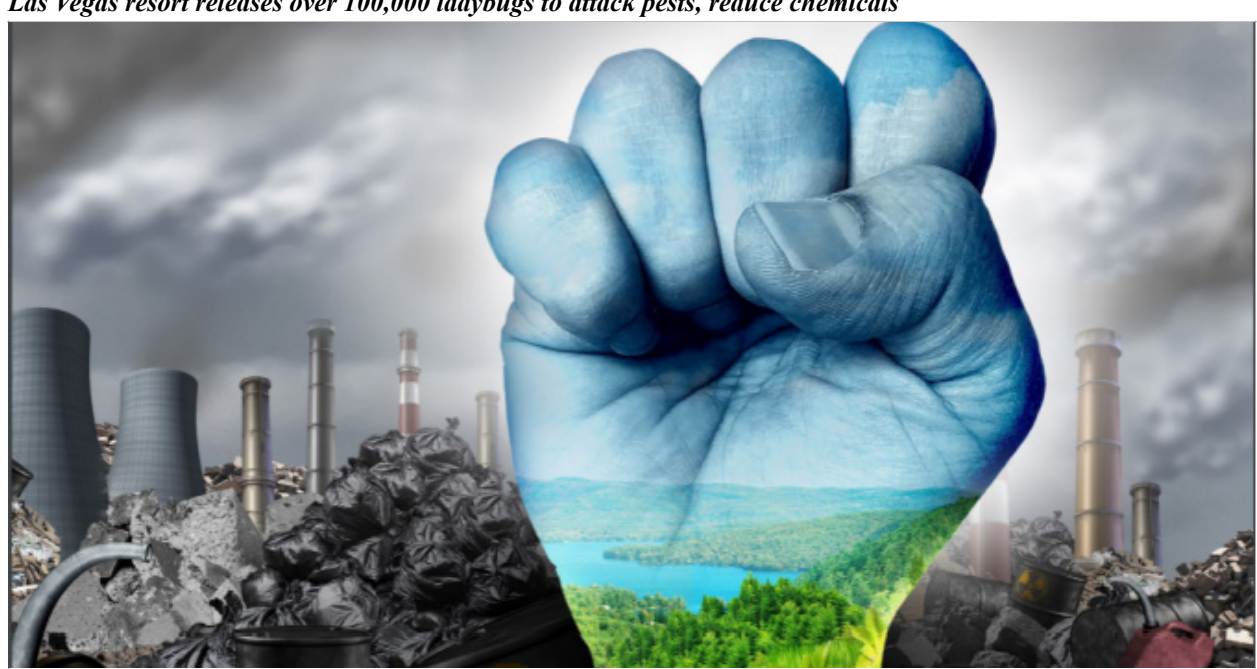
Environmental Justice Guide Helps Youth Create Change on a Local Level

Las Vegas resort releases over 100,000 ladybugs to attack pests, reduce chemicals