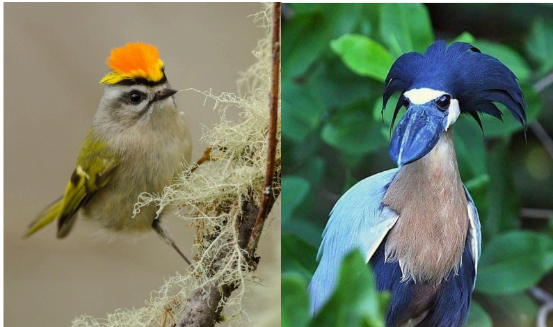
Golden-crowned Kinglet @jacobmcginnisphoto