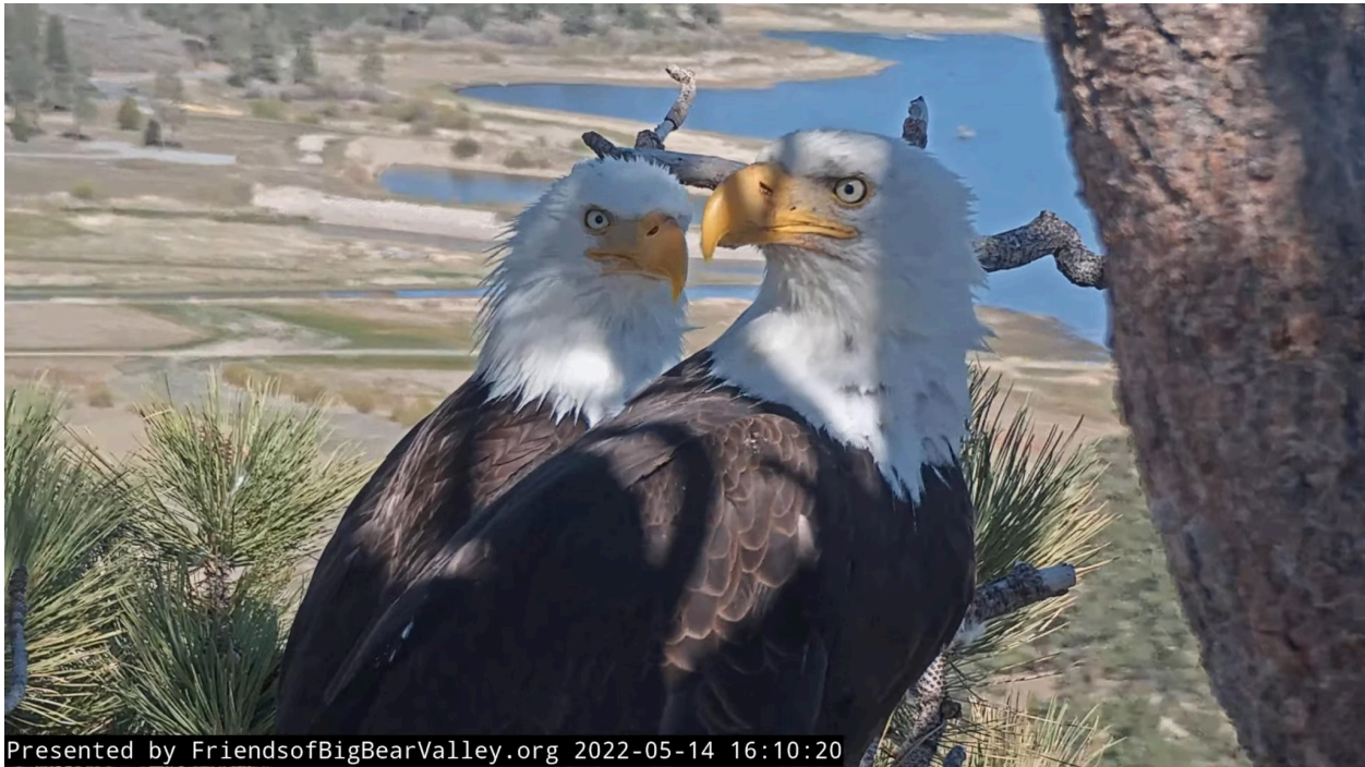
Regal Papa Shadow (L) Mama Jackie (R)