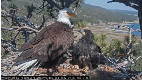
Spirit showing us her delight ~ her wingspan and pantalets!